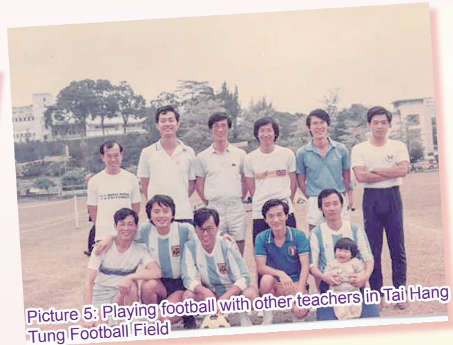
Picture 5: Playing football with other teachers in Tai Hang Tung Football Field

Q: What about the last picture you want to share with us?