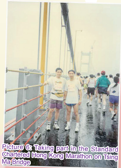
Picture 6: Taking part in the Standard Chartered Hong Kong Marathon on Tsing Ma Bridge