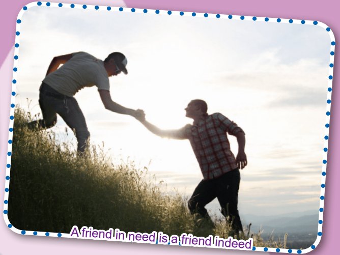
A friend in need is a friend indeed

I love this sentence because it reminds me of my good friends. Whenever I get into trouble, they will help me unconditionally.